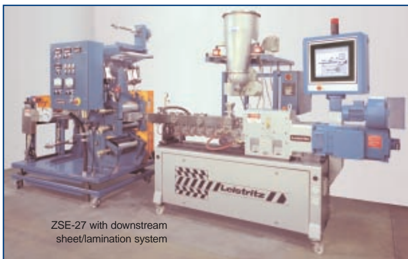
ZSE-27 with downstream sheet/lamination system