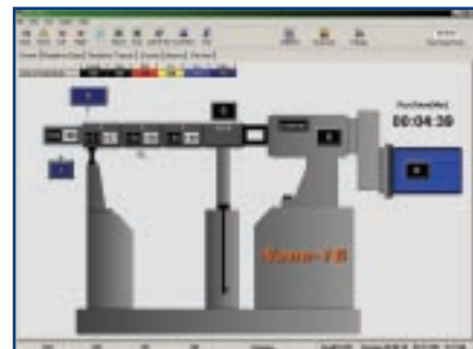
TSCS PC screen shot from Nano-16