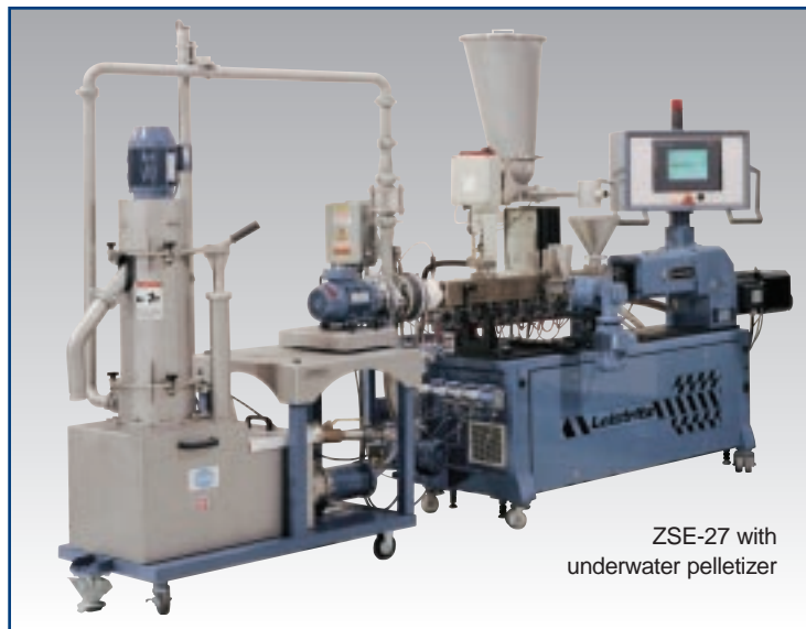
ZSE-27 with underwater pelletizer