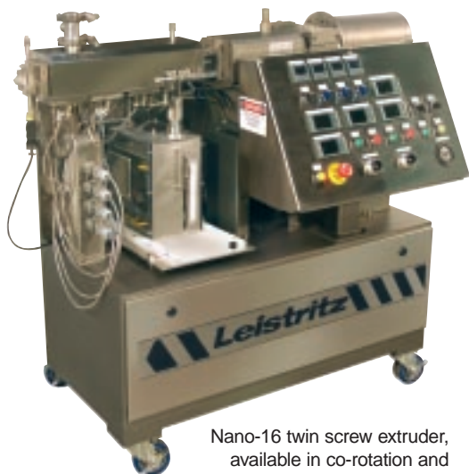
Nano-16 twin screw extruder, available in co-rotation and counterrotation

Whether you need to process a 20 grams or 300 lbs/hr, we have a small scale HSEI twin screw extruder to meet your needs