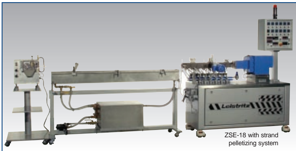
ZSE-18 with strand pelletizing system